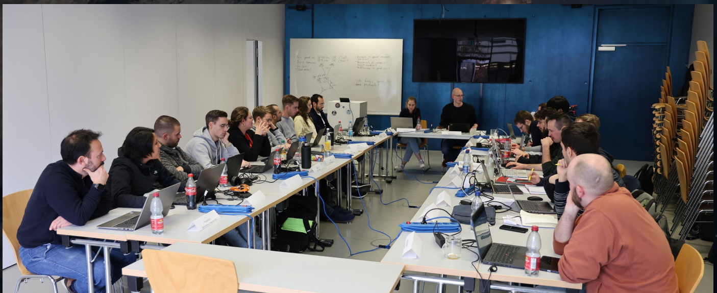
Figure 2: Doctoral researchers of the Collaborative Research Centre 1667 ATLAS tackling complex VLEO satellite mission and system design challenges during the internal Satellite Design Workshop .

with and further inspire young space-flight enthusiasts from schools across the state of Baden-Württemberg. This event constituted the concluding event of the Mission Zukunft: on to new horizons school student competition held in the framework of the state's THE aerospace LÄND initiative.